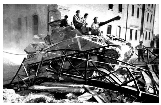
A Sherman in Italy, probably from 19th Armoured Regiment, 'C' squadron.

Due to the poor reputation British armoured support had in the eyes of New Zealanders, due mainly to 4 New Zealand Infantry Brigade at Ruweisat Ridge and 6 NZ Infantry Brigade at El Mreir being overrun by German tanks when the British armour failed to show up, forced General Freyberg, overall commander of the New Zealand forces, to take matters into his own hands. Failing to convince the New Zealand government that there was a need for an armoured brigade he decided to convert an existing Brigade, namely the 4th New Zealand Infantry Brigade, into the 4th New Zealand Armoured Brigade.