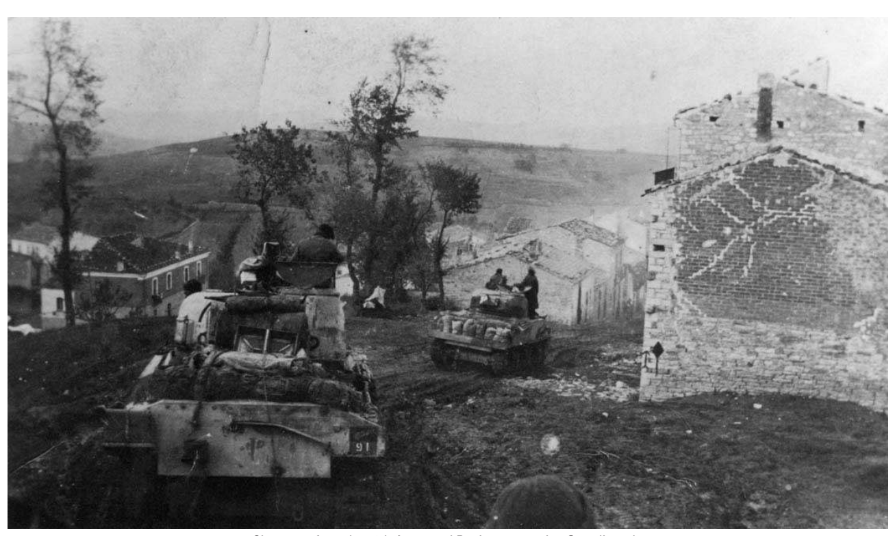
Shermans from the 18th Armoured Regiment entering Guardiagrele

Entering Italy saw the divisional symbols change from the common British system of having the unit and divisional symbols on opposite sides of the tank, to a combined insignia of a white fern leaf on black, in the top half and the unit number on the unit colour in the bottom half (see the diagram on the following page).