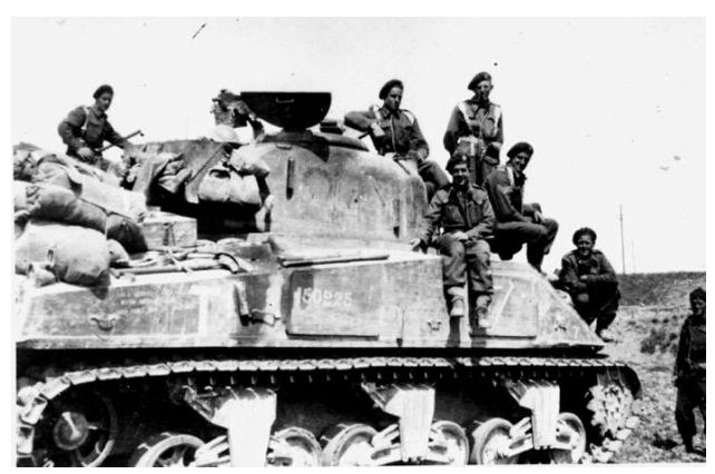
A Sherman from the 18th Armoured Regiment, 'C' squadron waiting to cross Po River.

19th Armoured Brigade was the first New Zealand tanks to see action, they were asked to assist the 3/8 Punjab Regiment, 19th Indian Brigade, 8th Indian Division to attack Perano to check the state of the Sangro bridge.