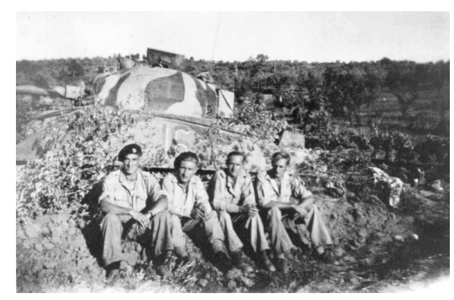
A Sherman from the 18th Armoured Regiment painted in mud-grey with blue-black patches.

The front then stabilised, ending the efforts in 1943.