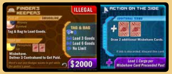
Badger Job with attached Big Damn Challenge

Instead of being Worked on their own, Challenges are attached to other Contacts' Jobs. To attach a Challenge to a Job, place it under the Job when you first Work the Job. You may not attach Challenges to Piracy Jobs or Bounties. You may not attach Challenges to Jobs already in the Active Job area.