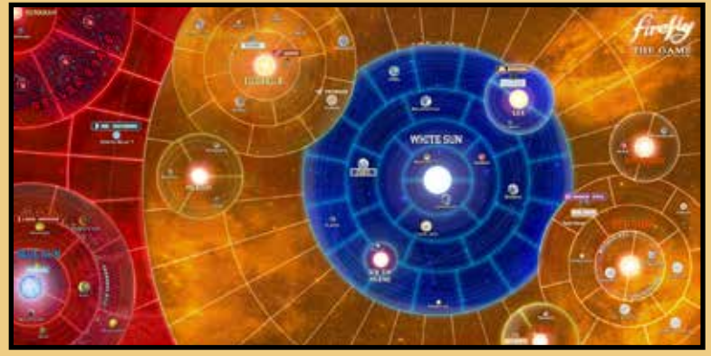
The three regions, highlighted

The 'Verse is divided into three regions. Rim Space Sectors are bordered in red lines. Alliance Space is bordered by blue lines, Border Space by orange.