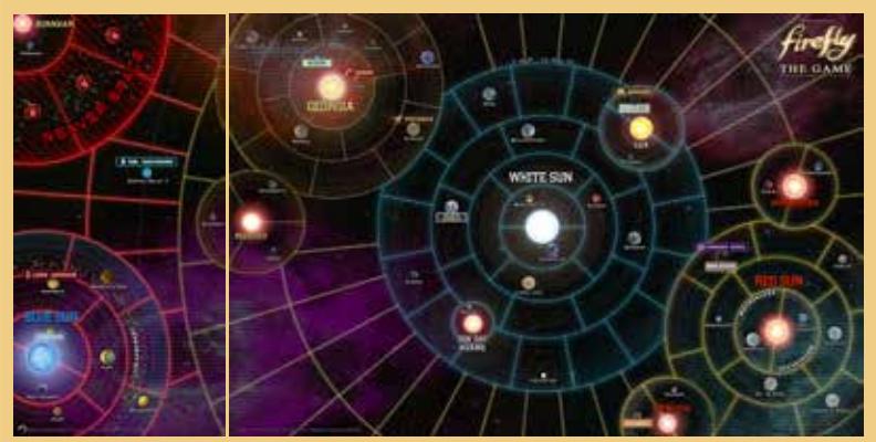
Original 'Verse Map with new Rim Space expansion on left

A new 10" x 20" map section fits on the left-hand side of the existing Firefly: The Game map. This new map extension both expands Border Space and adds a new region: The Rim. Combined with the original game, the board measures 20" x 40" - make sure you have plenty of room to play!