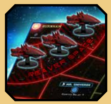
Reavers' starting locations

When setting up a game with Blue Sun , place a Reaver Cutter in each the three Reaver Space sectors, forming a blockade around Miranda. As the game progresses, the Reaver ships will move, opening up routes to Miranda.