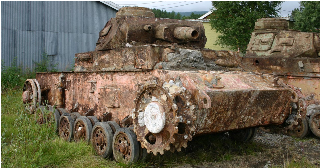
Arild Thrane Sandnes, August 2007 - http://www.tpmk.no/Forbilder/Panzer%20Setermoen.htm