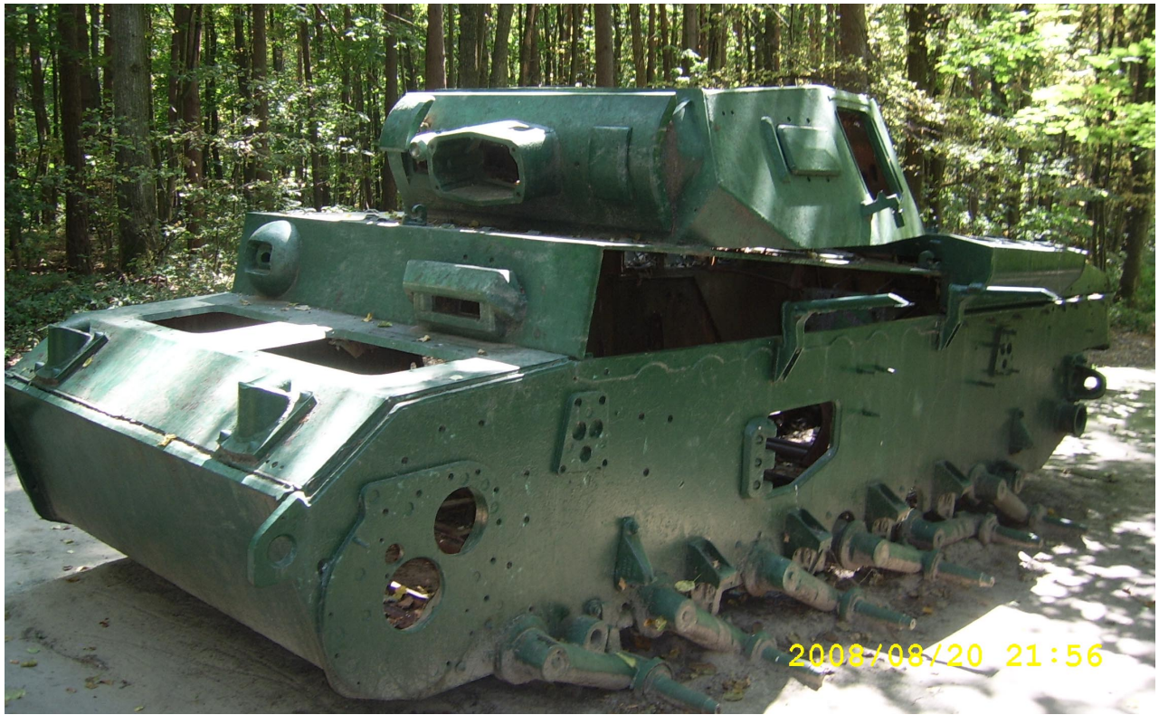
Pedro Valverde, August 2008