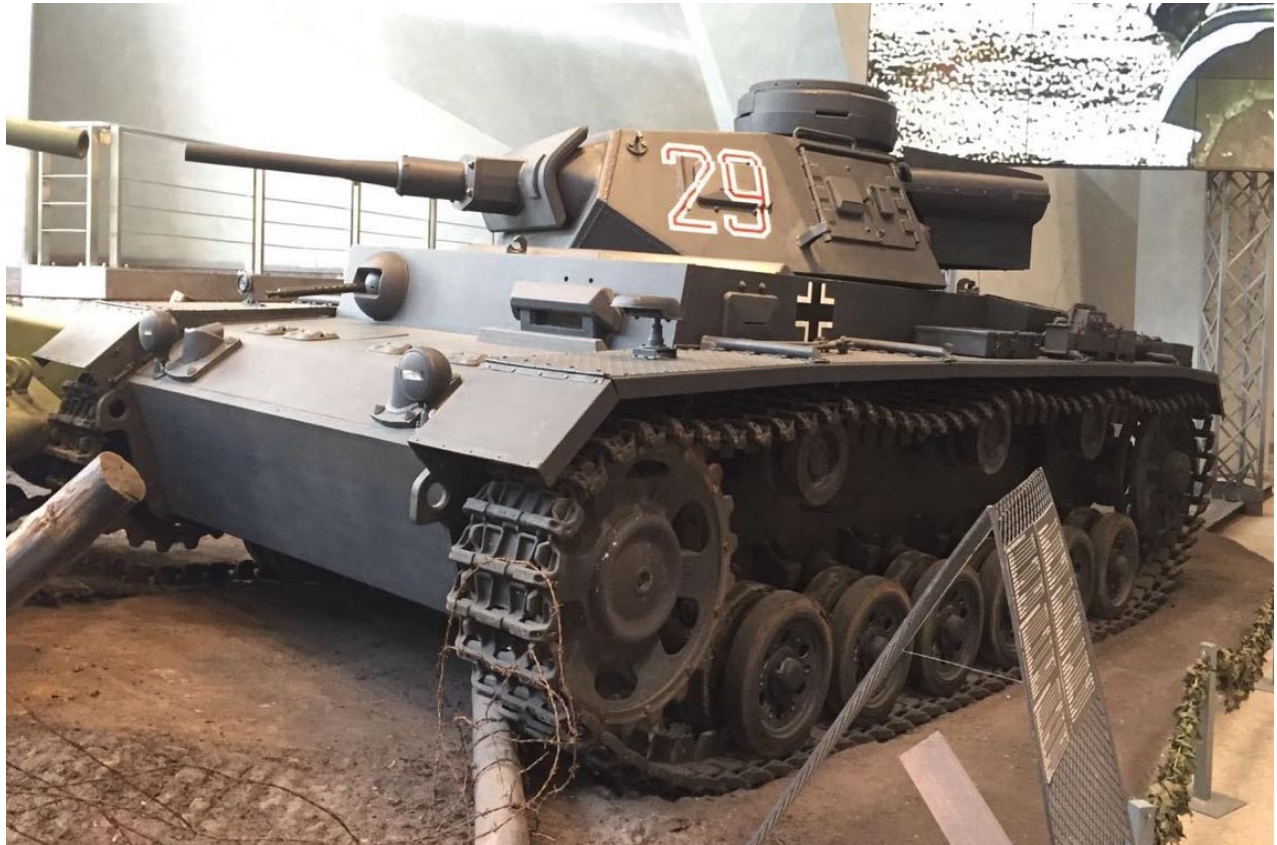
Dmitry Bushmakow, March 2016

This tank fell from a pontoon bridge in the Bug river in 1944, during a soviet bombing, it was recovered in the 90s (Rafał Białecki). Pics of the recovery : http://www.detektorweb.cz/index.4me?s=show&lang=1&i=12975