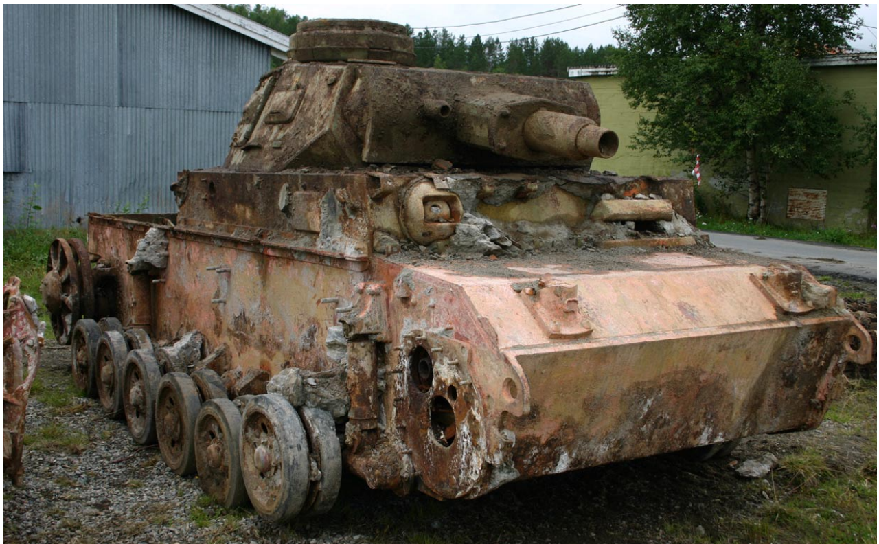
Arild Thrane Sandnes, August 2007 - http://www.tpmk.no/Forbilder/Panzer%20Setermoen.htm