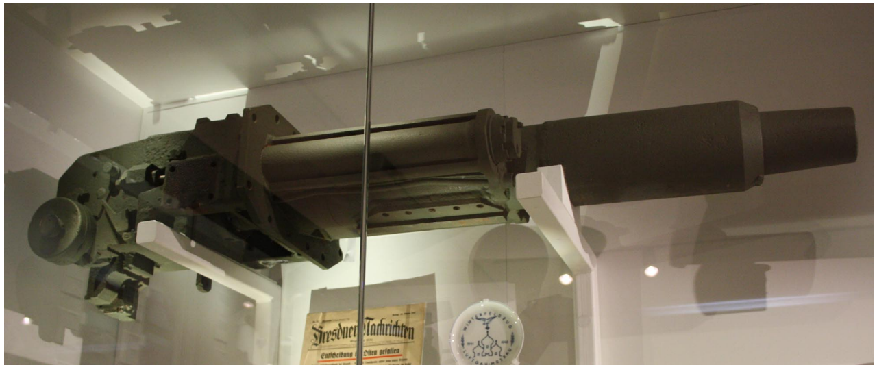
Walter Schwabe, October 2014