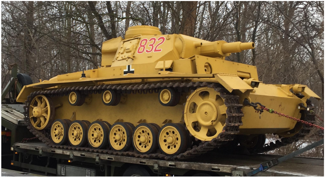
Niels Vegger, January 2016