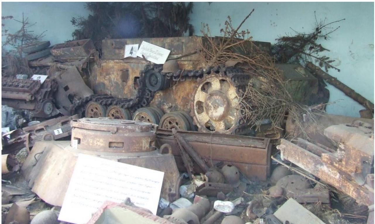
Andreas Edler, October 2007 - http://picasaweb.google.com/a.edler/AutoUndMotorradMuseumBadOeynhausen#

This tank has been used on a fire range near Ivanovo (north east of Moscow), and recovered in 2002. It has been restored in April 2002 (Yuri Pasholok). More pictures here: http://dishmodels.com/wshow.htm?p=461