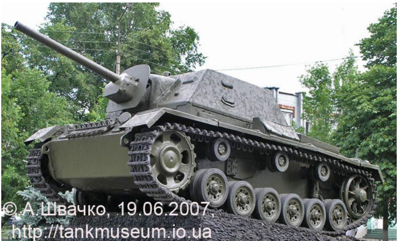
A. Chvatchko, June 2007 - http://io.ua/6530727

This tank was recovered from the European Theater of Operations (USA AFVs register)