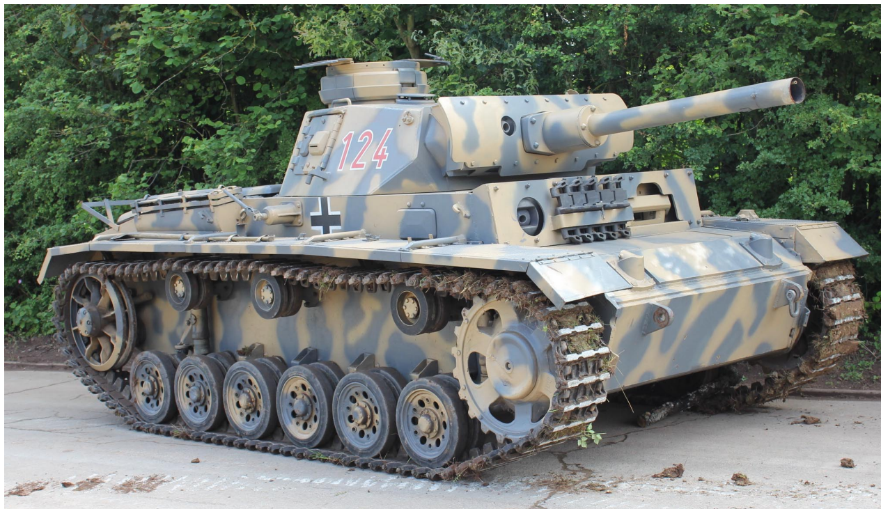
Hein Freud, June 2012 - http://freundhein11.fr.funpic.de/pics/120630/