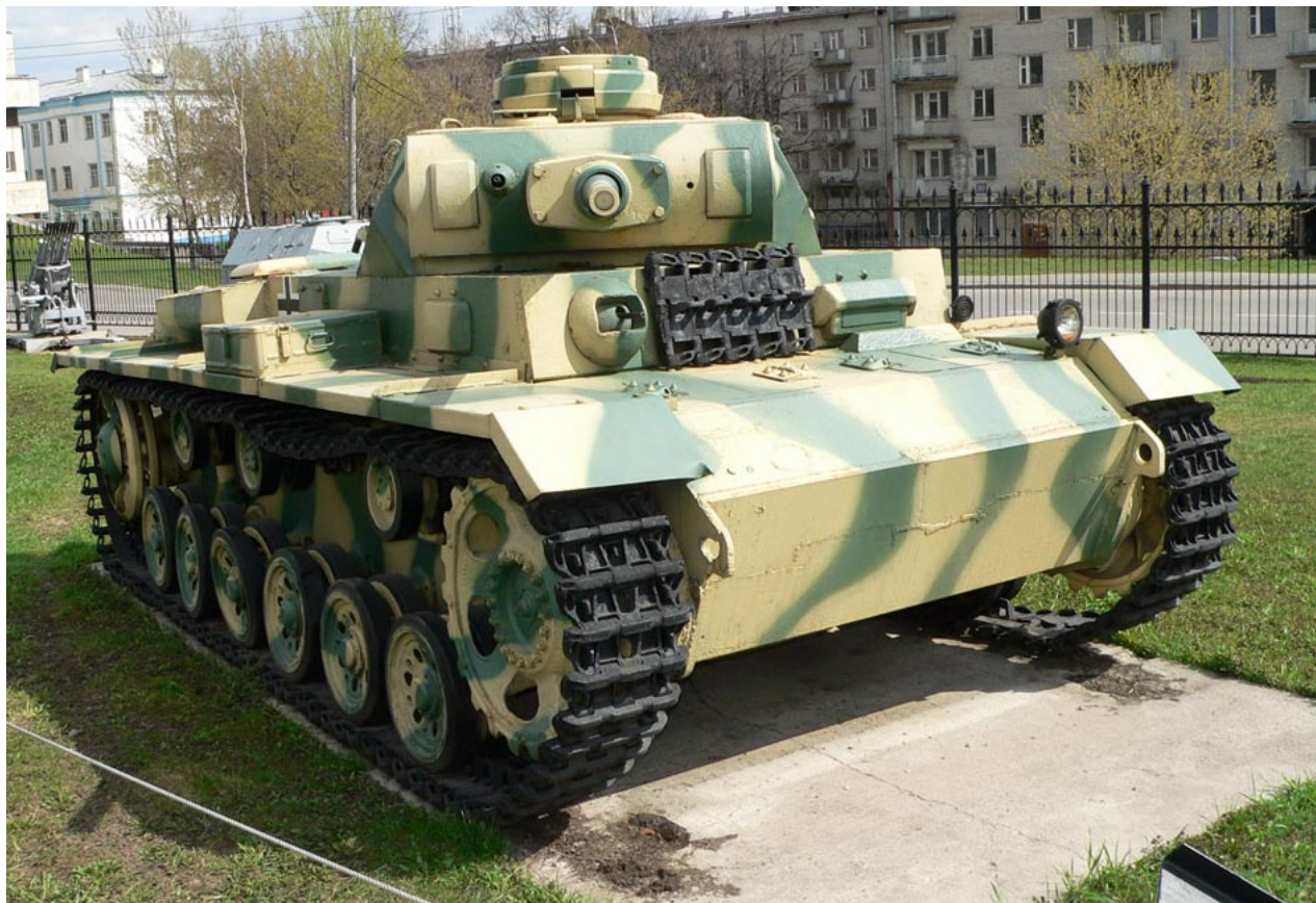
"Taranov", April 2007 - http://www.com-central.net/index.php?name=Forums&file=viewtopic&t=6736

The vehicle carries a L/42 gun, some parts of the hull are not original ("Taranov"). The vehicle is made on base of original Stug III ausf B hull, with hatches, loops wheels from other vehicle and upper structure from a Panzer III