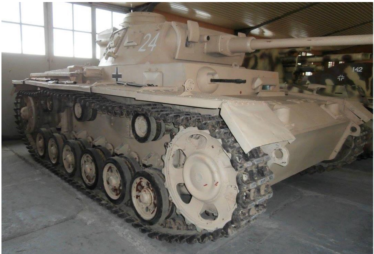
PzKpfw. III Ausf. J – Kolbpak forest, Putivl, Sumy Oblast (Ukraine)

https://www.facebook.com/fortwlochy/photos/a.1080963098621665.1073741846.692102714174374/1080967391954569/?type=3