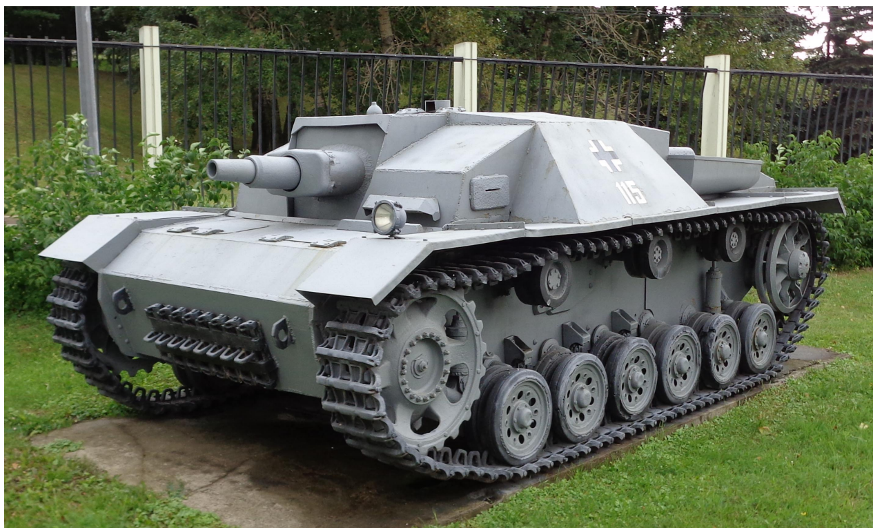
Jim Goetz, August 2015

The vehicle carries a L/42 gun, some parts of the hull are not original ("Taranov"). The vehicle is made on base of original Stug III ausf B hull, with hatches, loops wheels from other vehicle and upper structure from a Panzer III