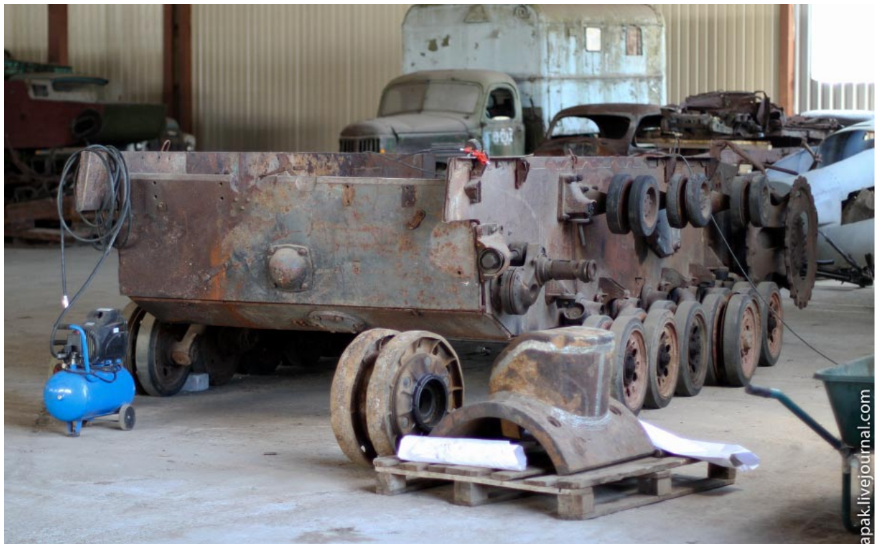
PzKpfw. III partial turret – Private collection (Russia)

http://sashapak.livejournal.com/52515.html