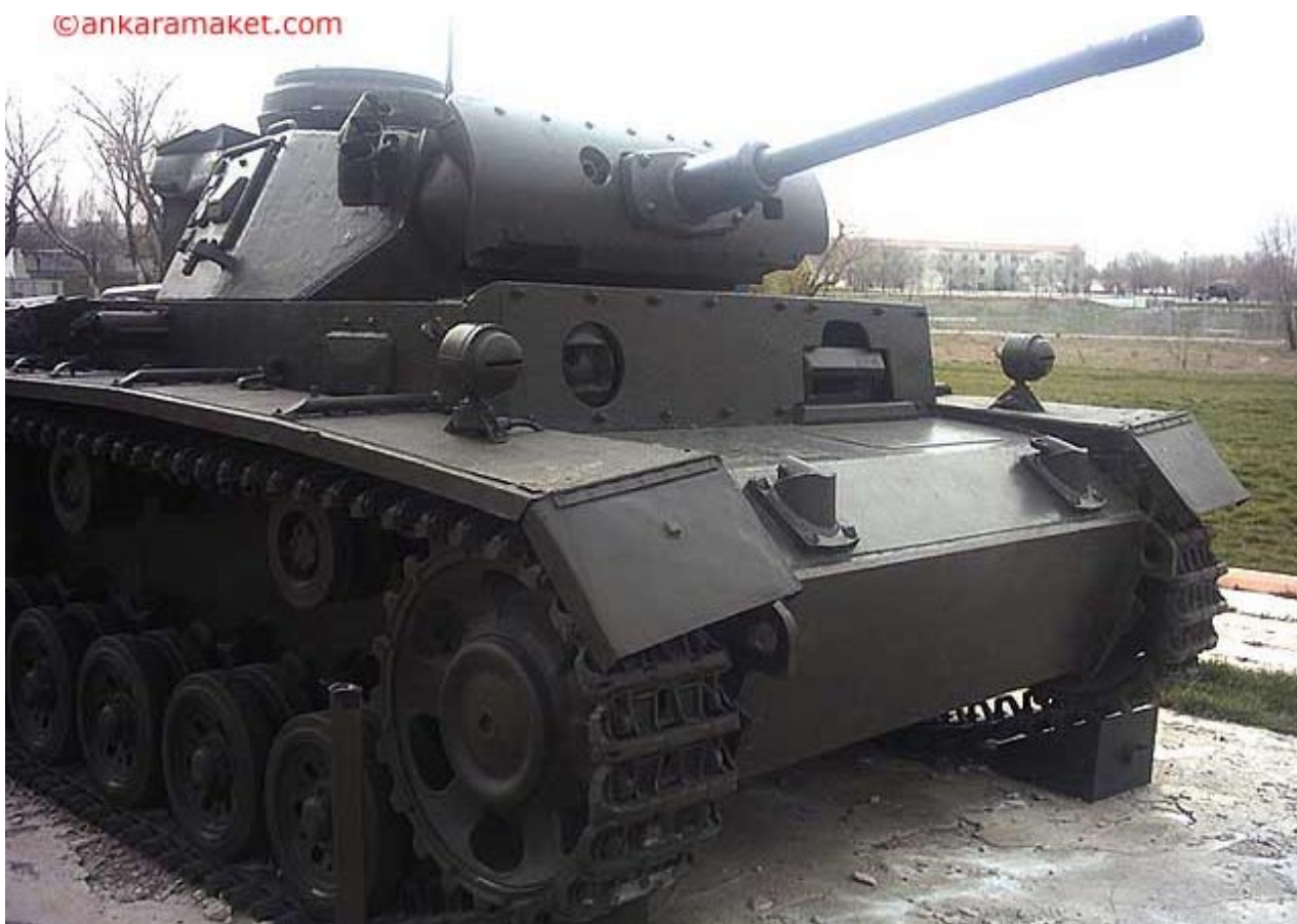
Ayhan Toplu - http://www.ankaramaket.com/rf_muze.htm