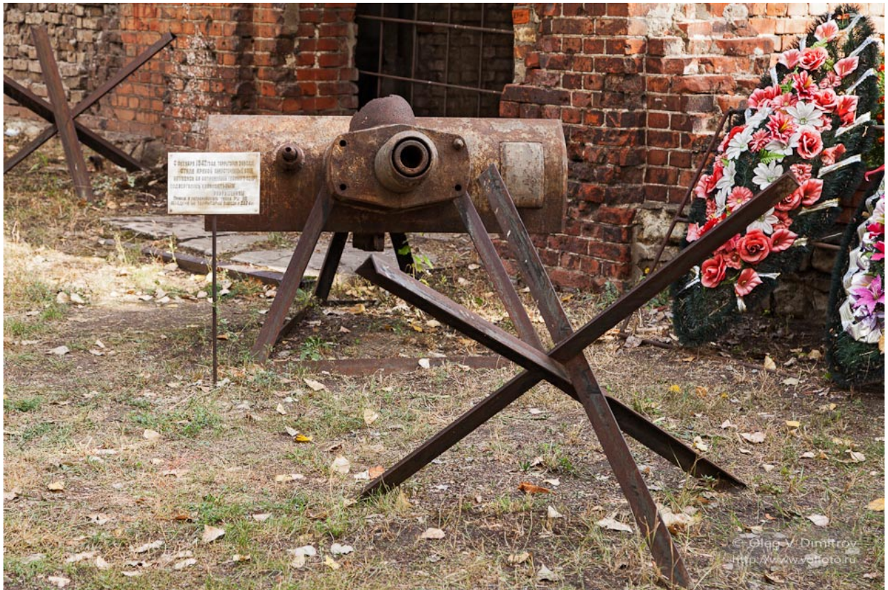
Oleg Dimitrov, October 2012 - http://www.volfoto.ru/volgograd/photos/3965.html

PzKpfw. III main gun – Red October factory, Volgograd, Volgograd Oblast (Russia)