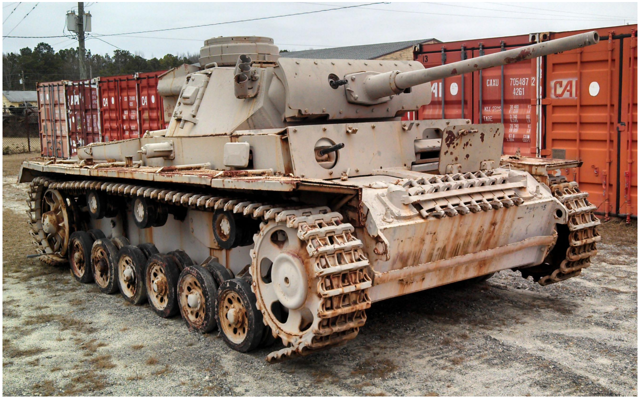
Robin McCollum - http://imgur.com/a/yrgJh