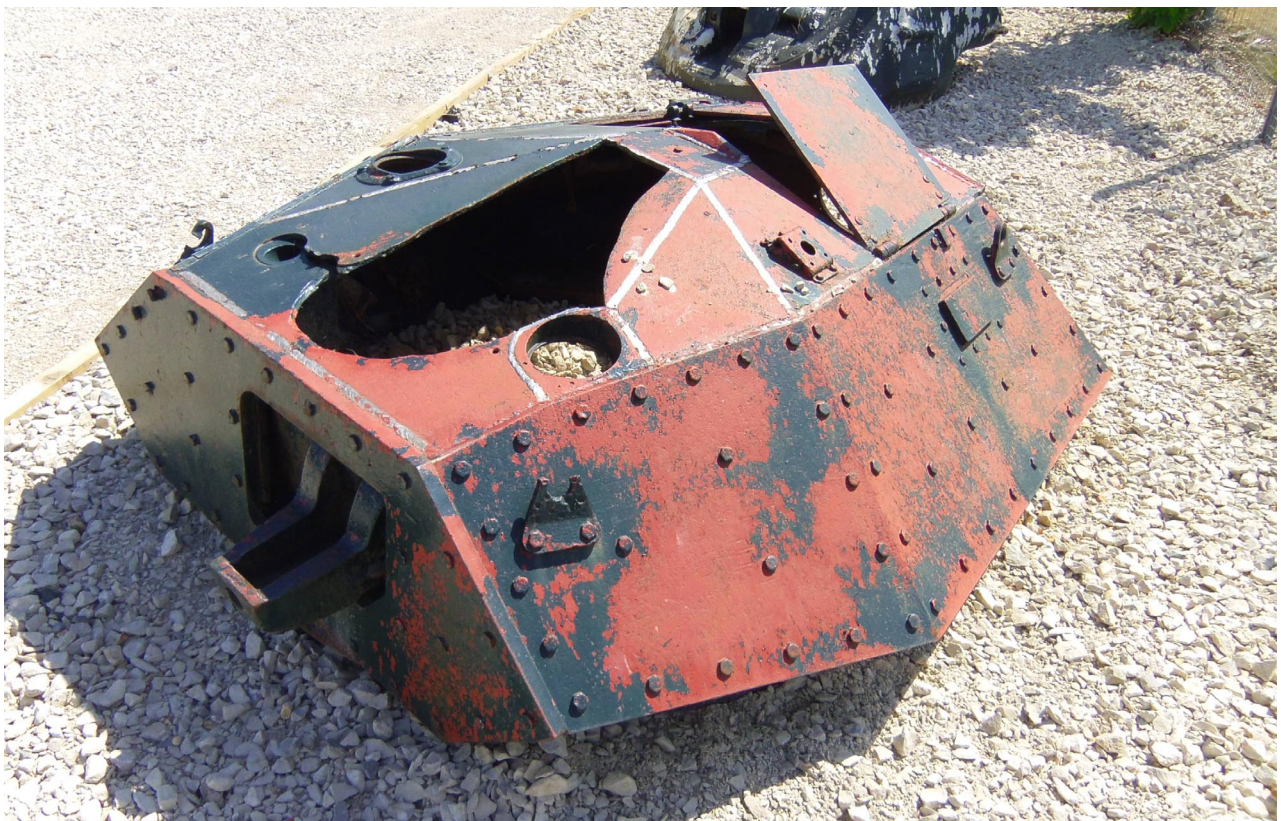
Covenanter (A13 Mk III) pilot model (very early/experimental) turret Bovington Tank Museum (UK)

Pierre-Olivier Buan, June 2014 - https://www.flickr.com/photos/13963542@N08/14571348804/in/set-72157645512102875/