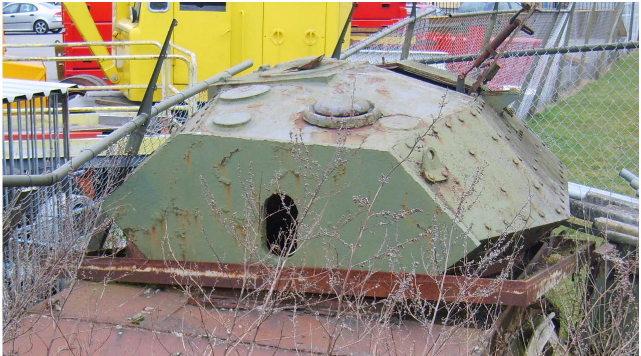
Walter Schwabe, March 2011