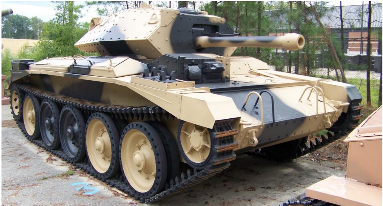
Neil Baumgardner, September 2009 - http://www.com-central.net/index.php?name=Forums&file=viewtopic&t=11960