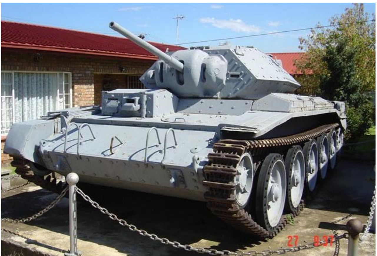
FJR Louw, January 2011