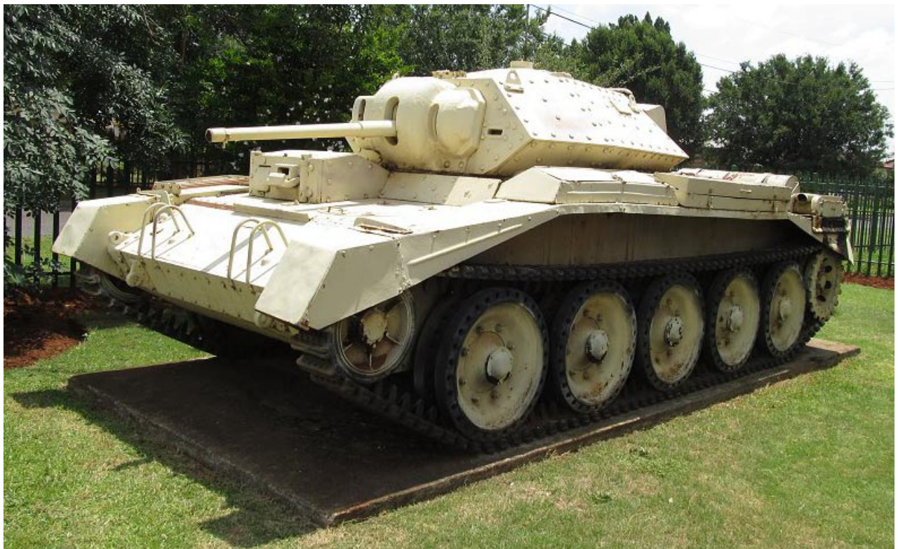
Crusader II (A15) – Dam Snake Park, Hartebeespoort, North West prov. (South Africa)

http://www.69dude.co.uk/gallery2/main.php?q2_itemId=1406