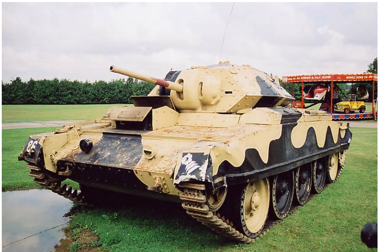
Crusader I (A15) – Royal Australian Armoured Corps Tank Museum Puckapunyal, VIC (Australia)

Martin Claydon, August 2002 - http://homepage.ntlworld.com/mclaydon/landmain.htm