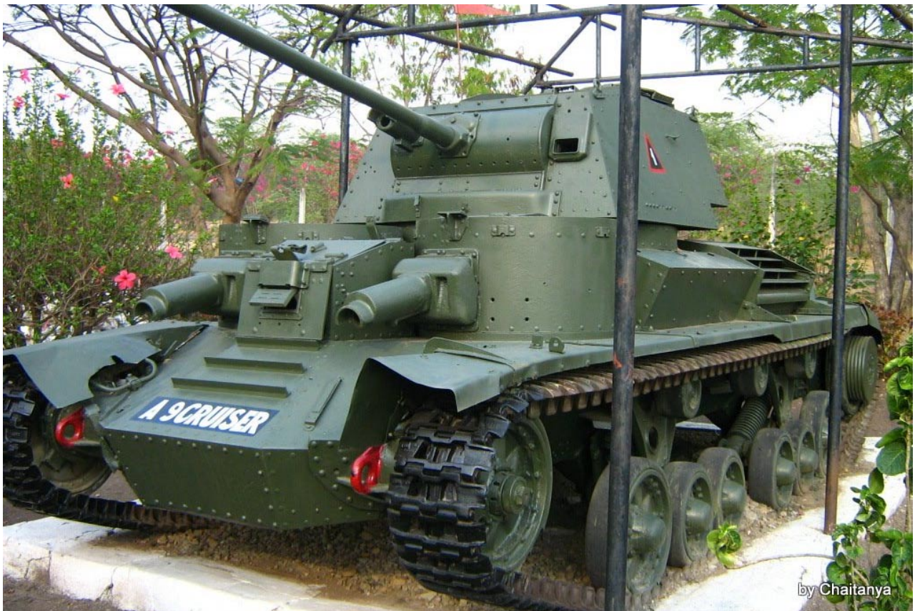
Cruiser Tank Mk I (A9) – Bovington Tank Museum (UK)

"Chaitanya", March 2009 - http://picasaweb.google.com/chaitanya.vedak/20090315PuneNagarOneDayTrip#5313670271230879970