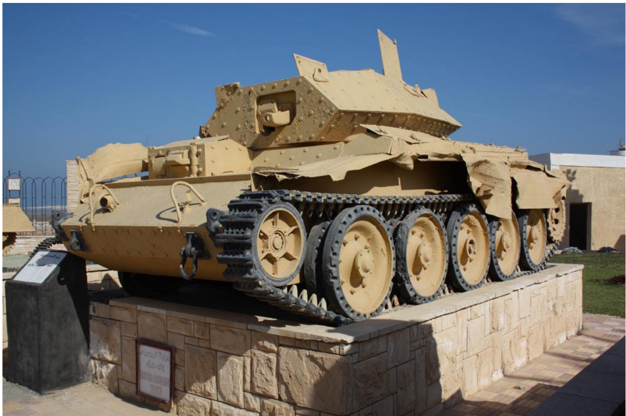
Crusader III (A15) – Bovington Tank Museum (UK)

Ken Meegan, November 2012 - http://www.flickr.com/photos/namcys11/8253718545/in/set-72157627361694065