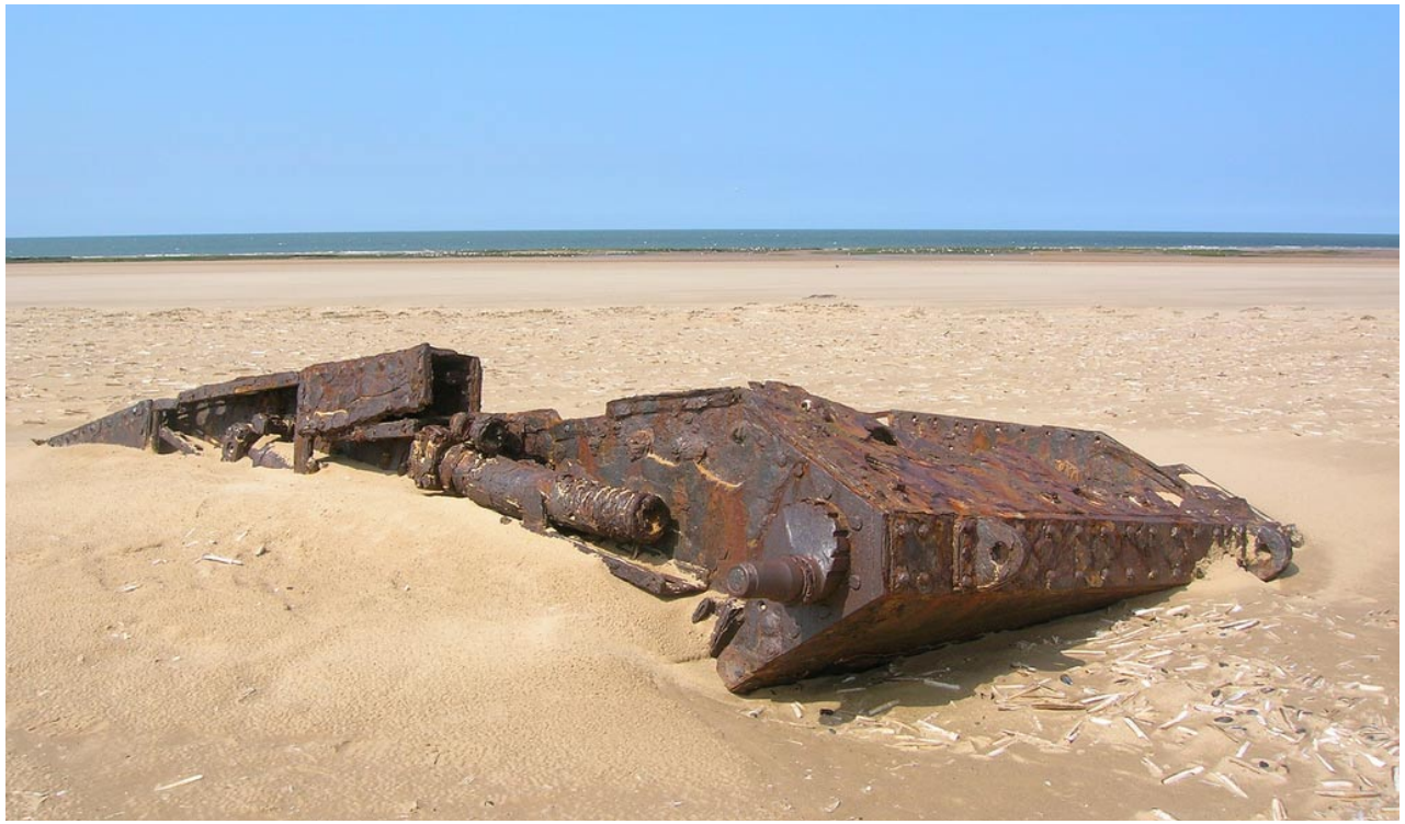
"DT25", June 2009