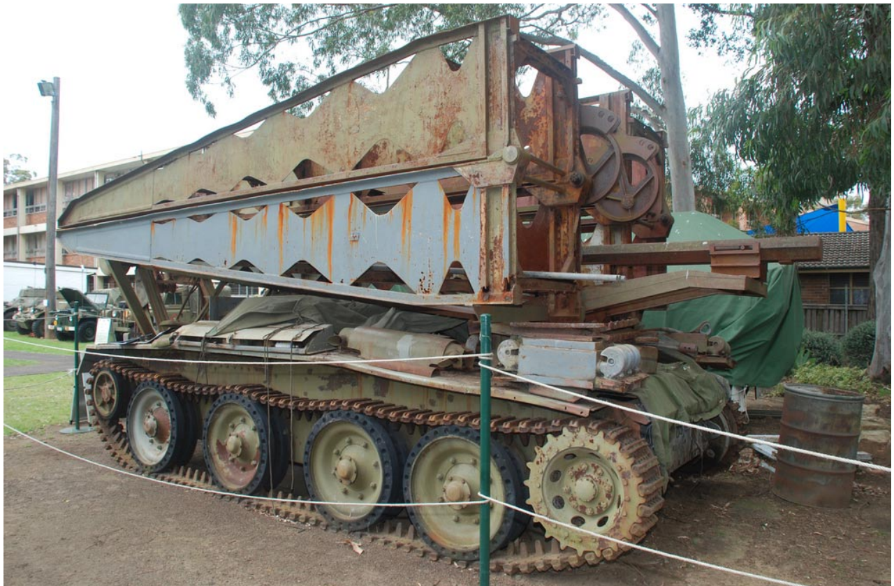
"TMA 0", June 2009 - http://www.flickr.com/photos/39568612@N08/sets/72157619895388361/?page=3

Covenanter Bridgelayer – Royal Australian Armoured Corps Tank Museum Puckapunyal, VIC (Australia)