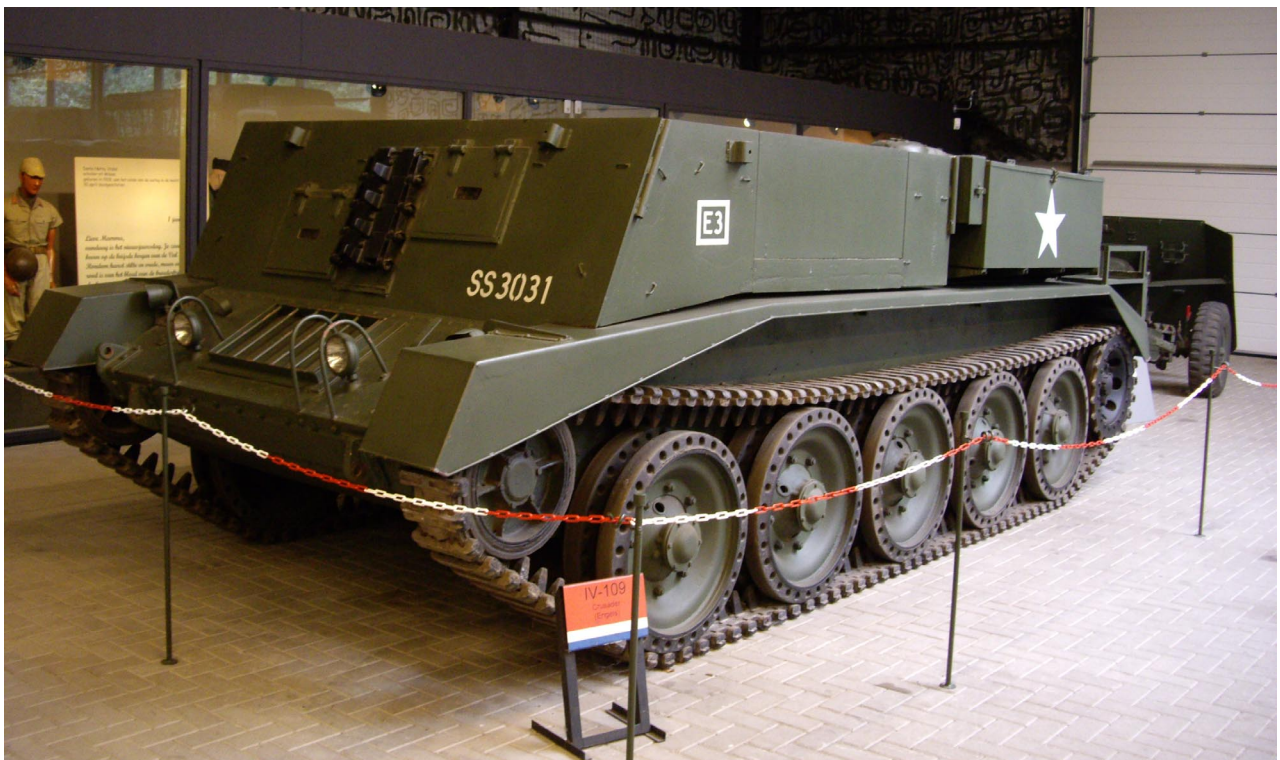
Crusader III AA Mk III (A15) – Musée des Blindés, Saumur (France)

Pierre-Olivier Buan, August 2008 - http://news.webshots.com/album/566321611vZcJYT?start=36