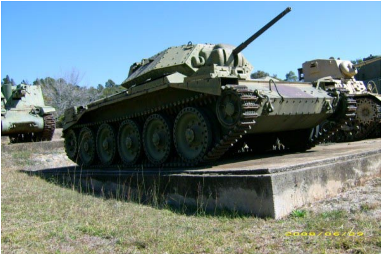
Gavin Spowart, June 2008