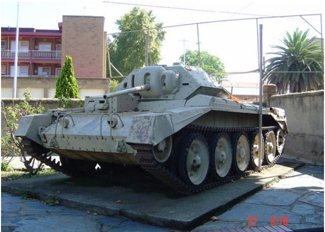
Crusader II (A15) – Light Horse Regiment, Kelvin, Johannesburg (Rep. of South Africa) The barrel is a fake one