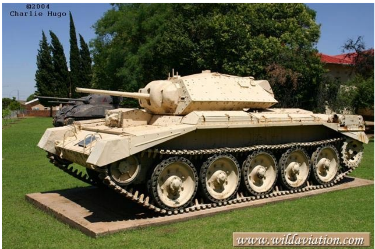
Charlie Hugo, 2004 - http://wildaviation.co.za/gallery2/main.php/milmuseums/Bloem-Armour-Museum/WWII/Crusader/?q2_page=3