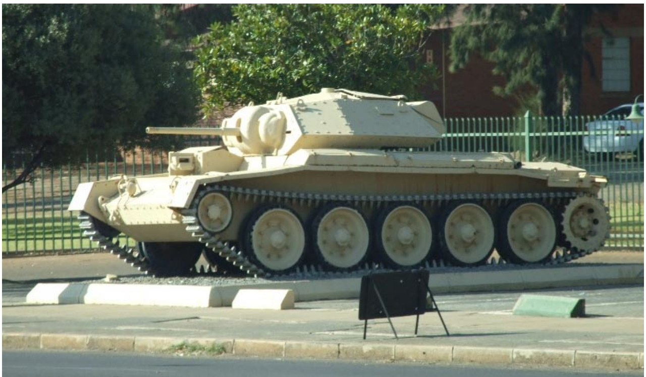
Crusader II (A15) – Warrior Shellhole, Muldersdrift, Gauteng province (South Africa)

http://www.69dude.co.uk/gallery2/main.php?q2_itemId=161&q2_page=5