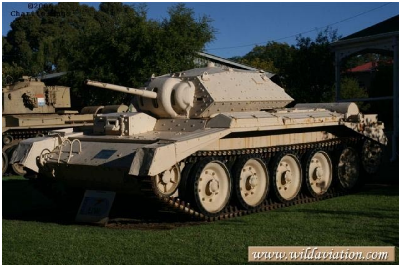
Charlie Hugo, 2006 - http://wildaviation.co.za/gallery2/main.php/milmuseums/Bloem-Armour-Museum/WWII/Crusader/