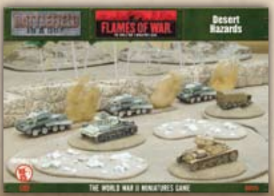
BB125 'Desert Hazards' contains everything you need to represent Wreakage and Uneven Ground. For further Desert terrain options see Hellfire & Back.