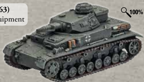
Panzer IV D